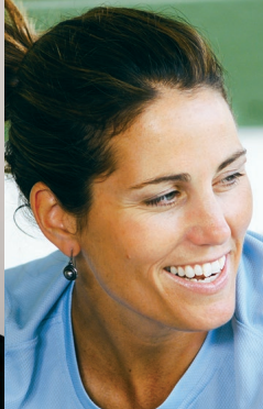
JULIE FOU DY